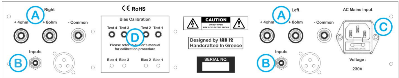
SUARA Rear panel

In rear panel you will find the connection inputs and outputs.